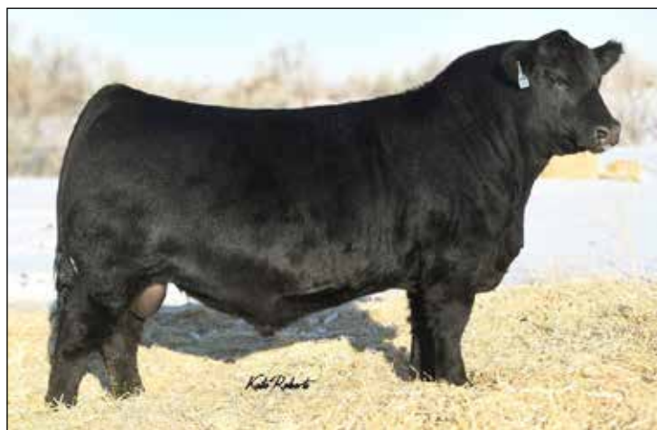
SIRE TO LOT 19 LT CHIEFTON 1440

SCC Chief King is a well-balanced Angus sire that blends added performance with exceptional structural quality. Ranking in the top 35% for WW, 25% for YW, and 25% for RADG, he delivers consistent growth and post-weaning performance. He adds maternal value with milk in the top 20% and calving ease maternal in the top 30%. Chief King truly excels in foot quality, ranking in the top 2% for claw and 3% for angle, offering soundness and longevity. Backed by solid carcass data with above-average REA and fat accuracy, he is a versatile, problem-solving sire for progressive cattlemen.