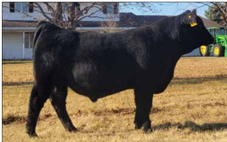
MATERNAL BROTHER TO LOT 6

A bull that has pushed the envelope in terms of growth from day one and has been no different since arriving at the test. He carries an overwhelming amount of performance and carcass merit, with a weaning weight ratio of 109. He sports a wide top, big hip, an excellent disposition and is anchored by one of our best young Exclusive daughters. Ranks top 2% WW, top 3% YW, top 2% Carcass Weight, top 15% $C. Carries CAB stamp. Genomic Tested.