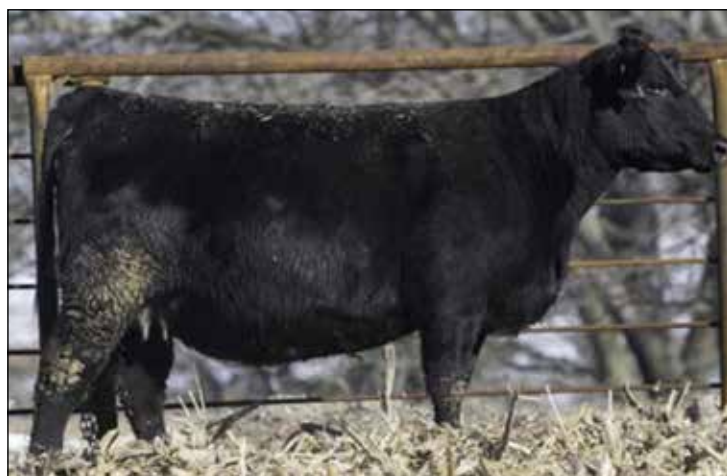
DONOR DAM TO LOT 18 KOCH ANGUS BARBARA 1117

Here is your chance to get a high growth bull that will add pounds and frame to your calf crop in a big way. He had a weaning weight of 851 lbs. And he is Top 3% WW and Top 2% YW with tremendous CW, marbling, and REA numbers and values to go with it. His donor dam is an impressive cow selected as a donor out of the Koch dispersion. If you want to add frame and pounds of performance to your calf crop this is your bull. His EPDs are HD 50K enhanced.