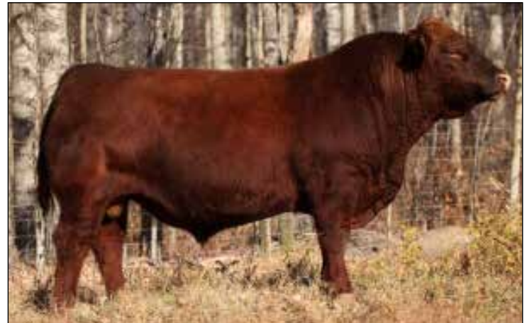
SIRE TO LOT 44 SAS COPPERHEAD G354

SHRS 38 Special 520N is sired by 38 Special 801J, who is a popular son of Something About Mary and a Pays To Believe daughter. 520Ns dam is a productive County O daughter. 520N is a bull with length of body, depth of rib and muscle shape with structural correctness with a splash of chrome and eye appeal. 520N carries a balanced set of EPDs and carcass traits.