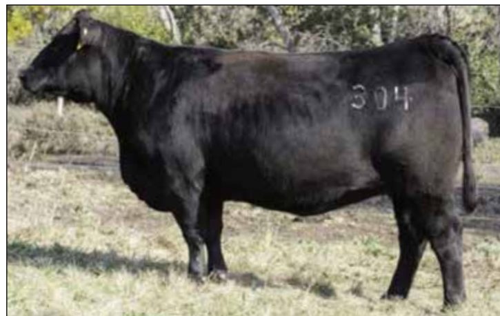
DAM TO LOT 4 KM PRINCESS 304

A heifer bull with added growth! This elite calving ease Foundation son blends together length, body shape, and sound structure. He has the looks of a easy going, practical herdsire that can transmit genuine muscle shape and carcass traits. His dam is a brood cow in the making with extra length and performance. On paper, he carries a no holes EPD profile, ranking in the top 2% CED, top 10% BW, top 10% carcass weight, top 10% Marbling, top 4% $C. Carries CAB stamp. Genomic Tested.