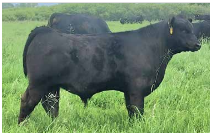
LOT 6 AT 4 MONTHS OF AGE

A pasture favorite and standout from early on! 511 demands your attention with his explosive muscle shape, stoutness of bone and sheer performance. Standing on excellent feet, he provides real world traits to push any seedstock or commercial program to the next level. His dam has been a herd bull producing machine, stamping her calves with growth and power. Genomic Tested.