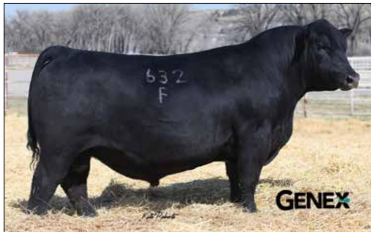
SIRE TO LOT 17 KR BARRICADE 3119

One of the very best top indexing bulls of this test at a 115.1 ratio for gain. He is a true calving-ease bull that has out performed nearly every bull on this test finishing 2nd in average daily gain at 5.05 ADG. That puts him near the top of the index as well. A bull that has tremendous muscle and shape in a very attractive package that's easy to look at and like when you walk in the pen too. He also offers you tremendous $B and $C values at 324 $C. EPDs that are HD 50 K enhanced for accuracy too. A special bull that combines performance and calving-ease.