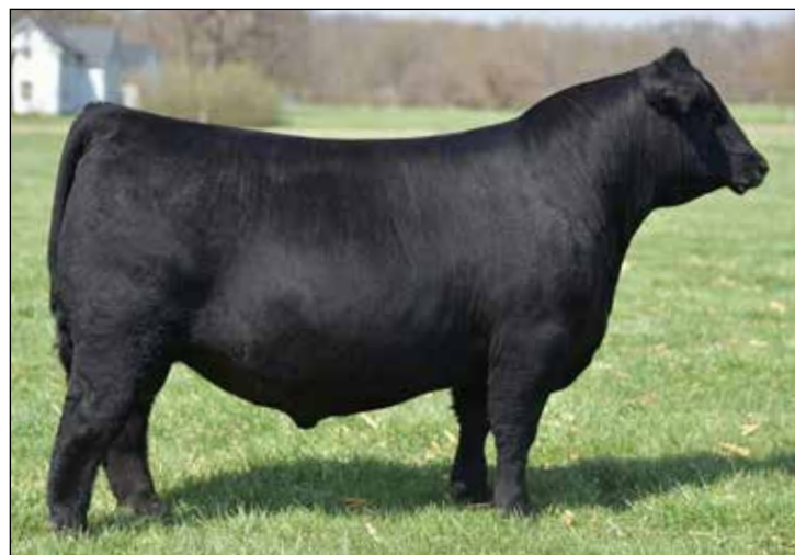
SIRE TO LOT 27 DAMERON VIROQUA

This exciting herd bull prospect is out of the sire Dameron Viroqua. Viroqua was bred by Woodhill Farms, and will be known as one of the last bulls out of this legendary herd. Viroqua's son and lot 27's brother, Alter, is one of the hottest bulls in the breed standing at Genex right now. This bull, out of a first calf Iconic heifer, has it all; calving ease, growth, marbling and great feet and legs. Bid with confidence on this outstanding bull.