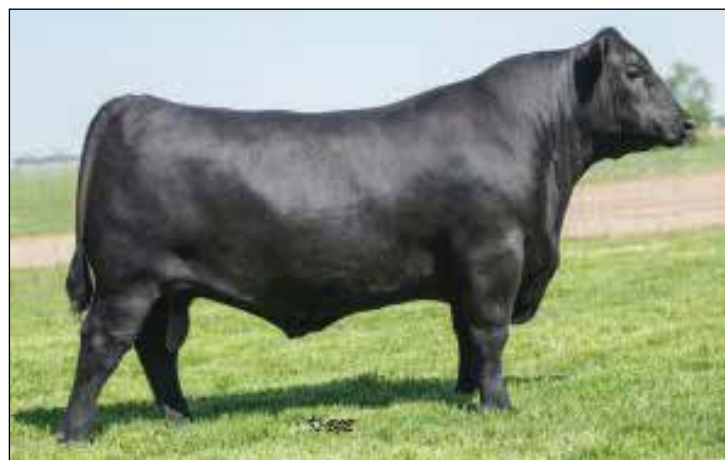
SIRE TO LOT 29 S S NIAGARA Z29

This bull's sire, Niagara and his sire, Hoover Dam, are two bulls that have really put their stamp on the Angus breed and show up on some of the most impressive high genomic pedigrees in the country with their exceptional marbling. His dam is a great cow in my herd. A Pathfinder cow having 6 calves with a weaning ratio of 108. With today's cattle prices I think 8% heavier calves would be enough reason to take this bull home and put him on your cows. This bull has a solid EPD and would work on cows and heifers.