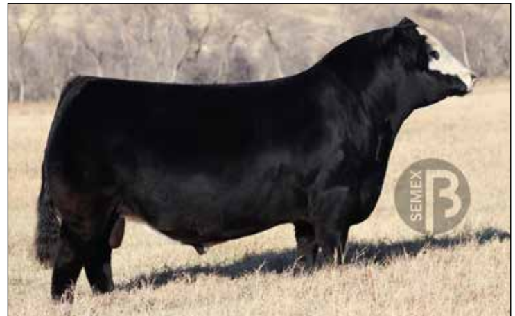
SIRE TO LOTS 45 & 46 LLW CARD TRUE NORTH G71

This attractive blaze faced bull will add weight and frame to your cow herd as well as have calves with moderate birth weights. Out of a proven ten year old cow who is an excellent mother and had the top simmental bull in the UWRB bull sale a few years ago. These Black True North bulls will work well in any herd. Offering style and added weight.